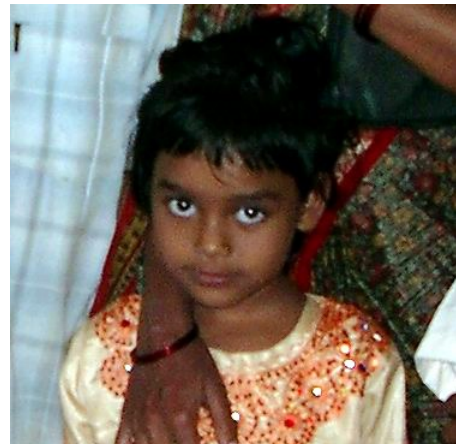
Now she hears and speaks!

The Holy Spirit has identified individuals at every seminar with various physical conditions. On one occasion, a pastor had an ear infection and had told none of us about it but the Lord revealed it. He was