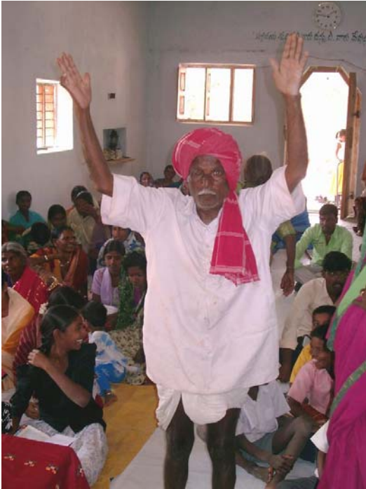
Paralyzed no more!