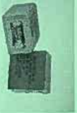
FISHMEAL POLYMER-BASED BAIT CONTAINING VACCINE

Raccoon rabies is found throughout Pennsylvania. It is a viral infection that can affect the nervous system of any mammal, including humans. The disease is almost always fatal to both people and animals. Raccoon rabies spreads rapidly and infects large numbers of raccoons. The disease often spreads to other wildlife and pets, making human exposure a real concern. To address this problem, federal, state and county agencies are participating in a combined program, to keep this animal epidemic from spreading further westward by attempting to eliminate or at least greatly reduce raccoon rabies in western Pennsylvania counties.