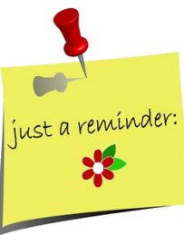
Photo taking will begin the week of May 22nd! If you have any questions, or need help signing up, you can call the parish office Tuesday thru Friday during business hours.

simply go to the Universal website, www.ucdir.com , click on the yellow sunburst icon, enter ne214 in the Church Code field and enter photos in the family Password field. Follow the prompts to schedule your family's appointment time.