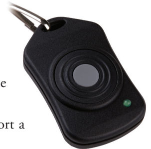
The Pendant tag

Transport function: Enable a resident to leave the facility for a family visit or other reasons. No need to share passcodes with family, or have a staff member bypass each exit individually.