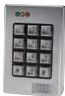
Outdoor Keypad 15615