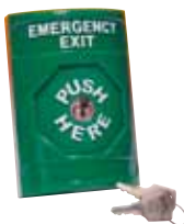
Stopper Station® Kill Switch 0200-134