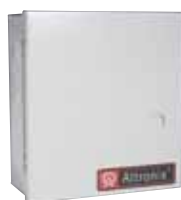
Power Supply 15560