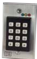
Indoor Keypad 15605