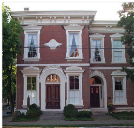
The Southern Deposit Bank, Russellville, now a private residence.