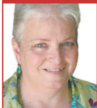
BY LIZ JOHNSON

tells the story of the famous Centralia massacre."