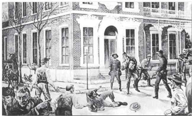
Mural depicting the Russellville bank robbery.

Reports of the James brothers turning up at a house wounded and in need of care is not uncommon. A cursory look through the census returns and birth records for Nelson County would seem to prove this to be