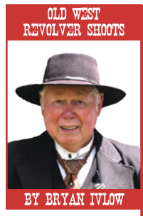
BY BRYAN IVLOW

Due to changes in government requirements, we found it necessary to purchase our own event insurance. To accommodate this expense, we are raising the cost of the shoots to a single fee of $25 per shooter beginning in 2015.