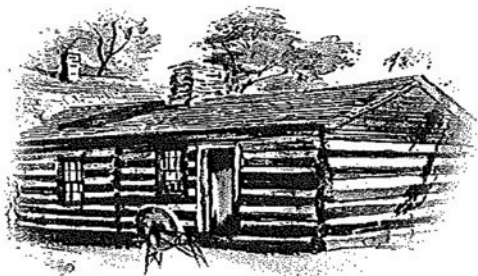
James homestead cabin — Original art by Jim Hamil

P.O. Box 404 Liberty, MO 64069 www.jessejames.org 816.736.8500