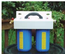
RV/Boat Disaster Relief Systems