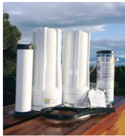
Easy-To-Install Countertop Systems