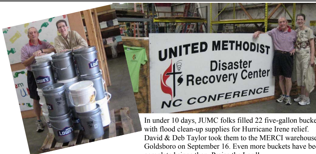
In under 10 days, JUMC folks filled 22 five-gallon buckets with flood clean-up supplies for Hurricane Irene relief. David & Deb Taylor took them to the MERCI warehouse in Goldsboro on September 16. Even more buckets have been completed since then. Praise the Lord!