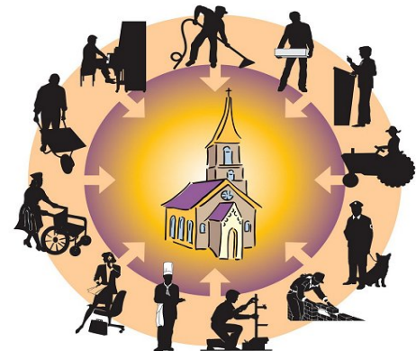
The Body of Christ

If we missed your birthday or anniversary, please contact the church office @ 775-7023.