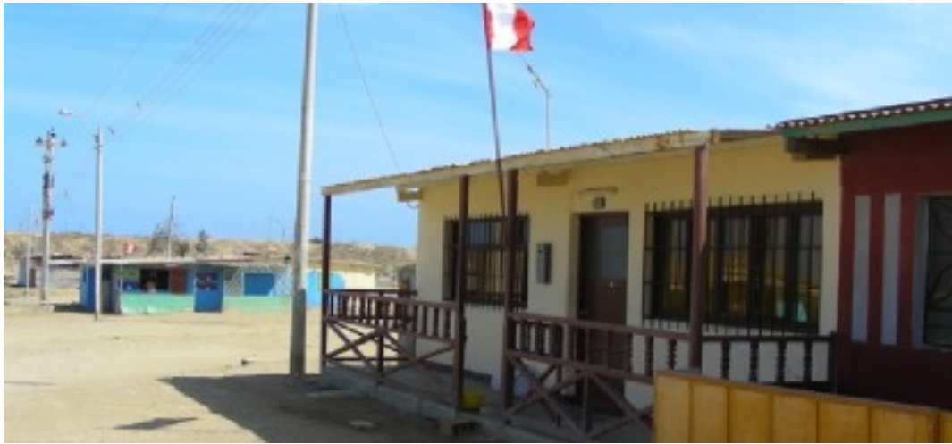
"The WAVES house"