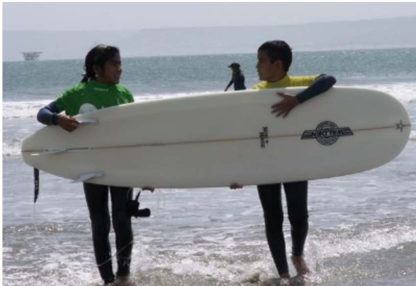
Youth participants in WAVES' Educational Surf Programming

The information in this pack is meant to expand on the information on the WAVES for Development website www.WAVESfordevelopment.org . Please ensure you have read the information on the website as a starting point.