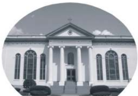
Park Presbyterian Church Newark, New York

“We will make Christ visible by believing, living and sharing the word of God.”