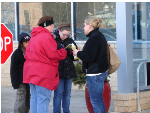
Handing out some "Joy".