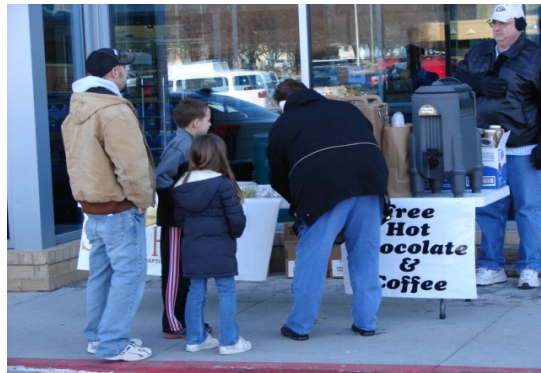
Reaching out to the community.