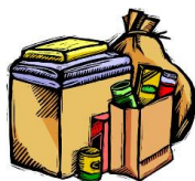
Food Pantry Donations Needed

The Siebels family have volunteered to deliver the food to Benson Baptist Church and deliver the clothing to First Baptist