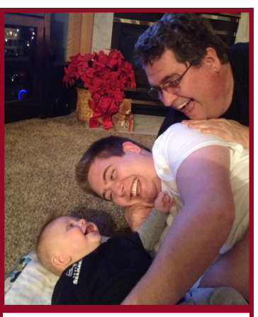
Three generations of Frisinger "boys" doing life together!