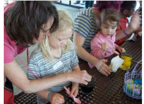
Dying Easter eggs is always fun.