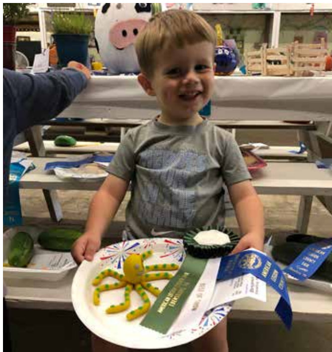
PREMIUMS: 1 st Ribbon 2 nd Ribbon 3 rd Ribbon 4 th Ribbon

We have tried to choose classes to which we felt the child would enjoy. HAVE FUN!