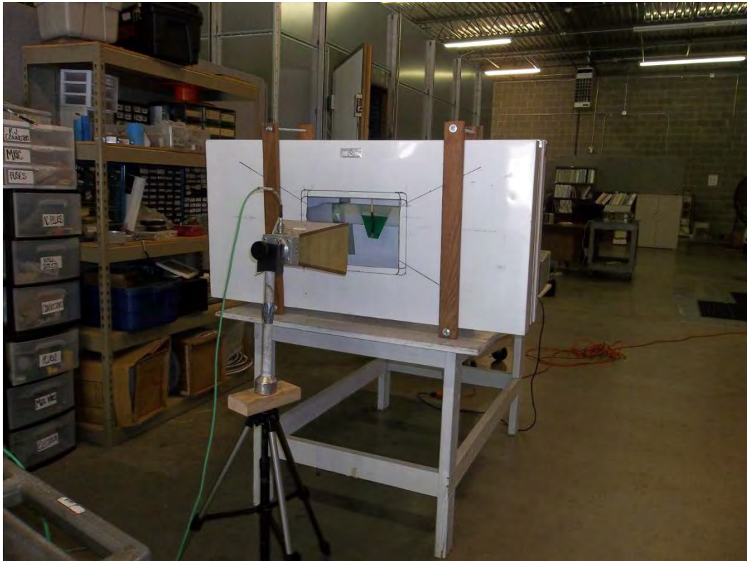
Figure 4. Photograph of the Open Test Enclosure