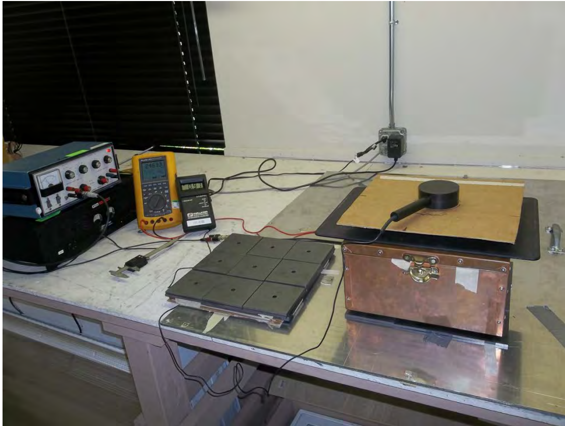
Figure 2. ELF EMR (Magnetic Component at 60 and 300 Hz) Test Configuration Photograph