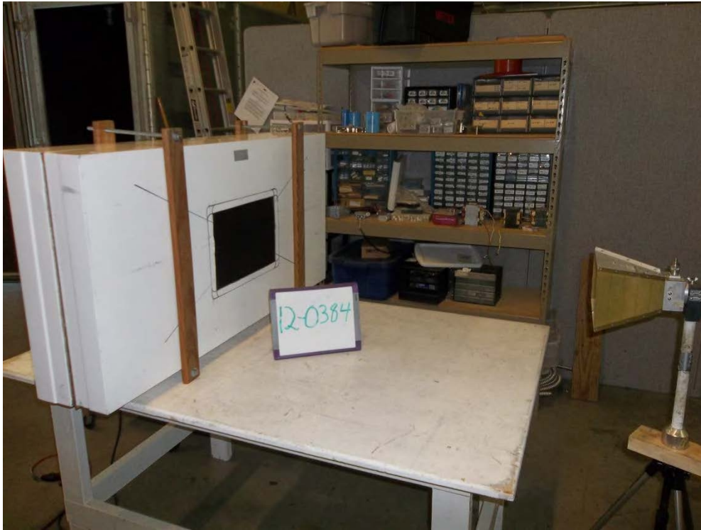
Figure 5. Photograph of the SUT Installed on the Test Enclosure