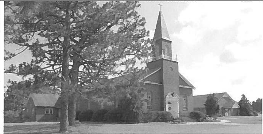
Culdee Presbyterian Church

U.S. Postage Paid West End, NC 27376 Permit No. 6