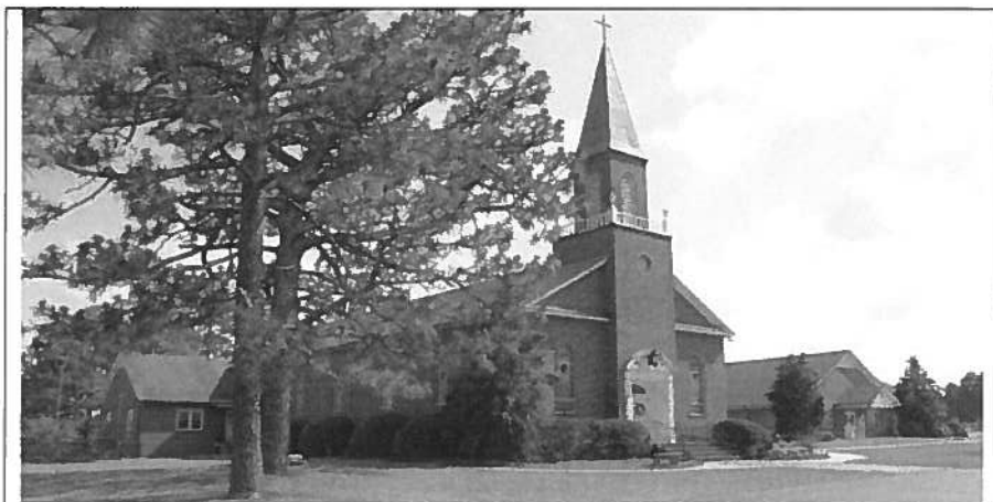
Culdee Presbyterian Church

U.S. Postage Paid West End, NC 27376 Permit No. 6