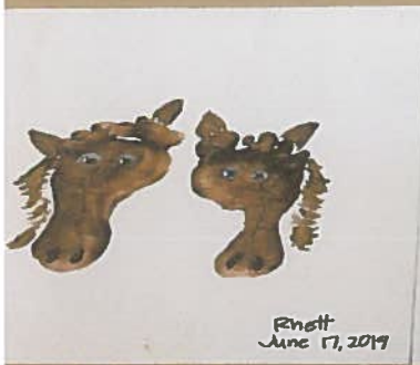
Rhett June 17, 2019