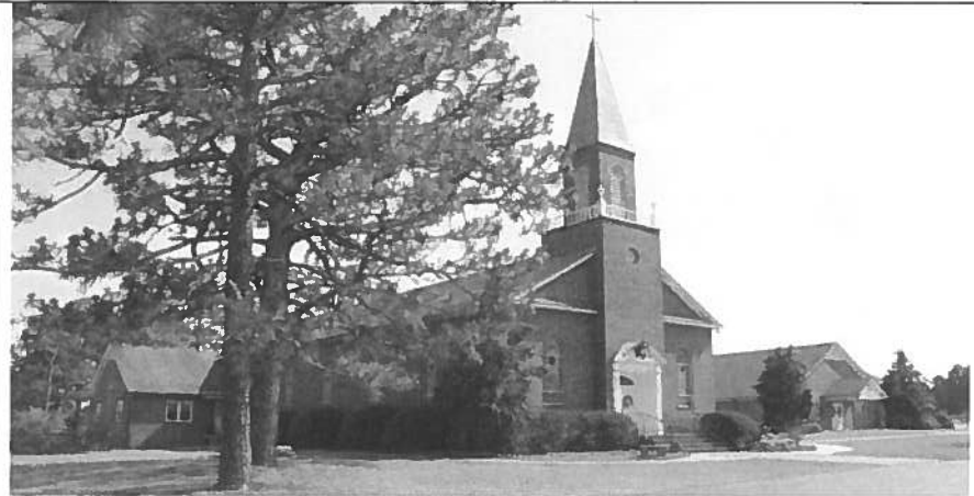
Culdee Presbyterian Church

U.S. Postage Paid West End, NC 27376 Permit No. 6