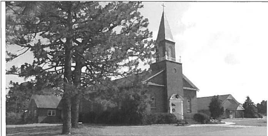
Culdee Presbyterian Church

U.S. Postage Paid West End, NC 27376 Permit No. 6