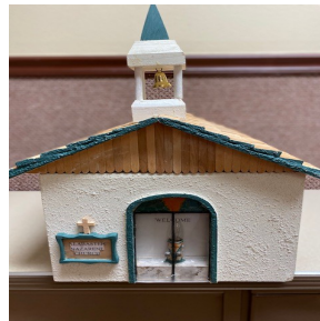
Children giving to Alabaster