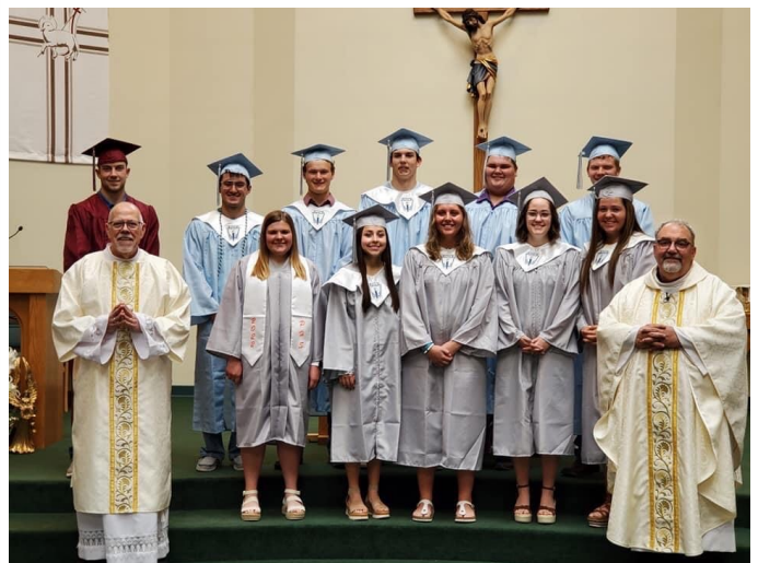
Then, Eleven soon to be high school graduates were honored at the ten o'clock mass on Sunday!

Graduates of St. Anthony's... Congrats to these seniors who will be graduating from Centura High School on May 7th.