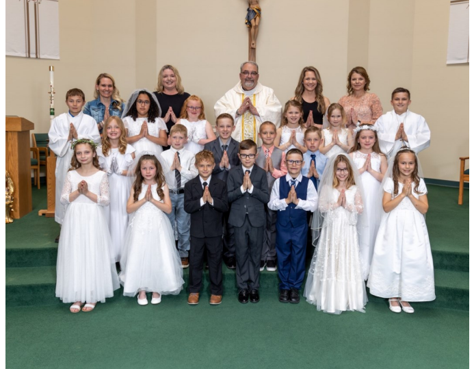
What a blessed weekend, April 23rd & 24th, at Saints Peter & Paul! Seventeen children celebrated their special sacrament of First Holy Communion during Saturday evening Mass!