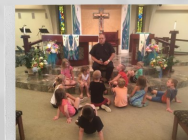
Totus Tuus 2021 St. Leo's Church Grand Island

Do you think I have come to give you peace on Earth? No, I tell you, but rather division. Luke 12:51