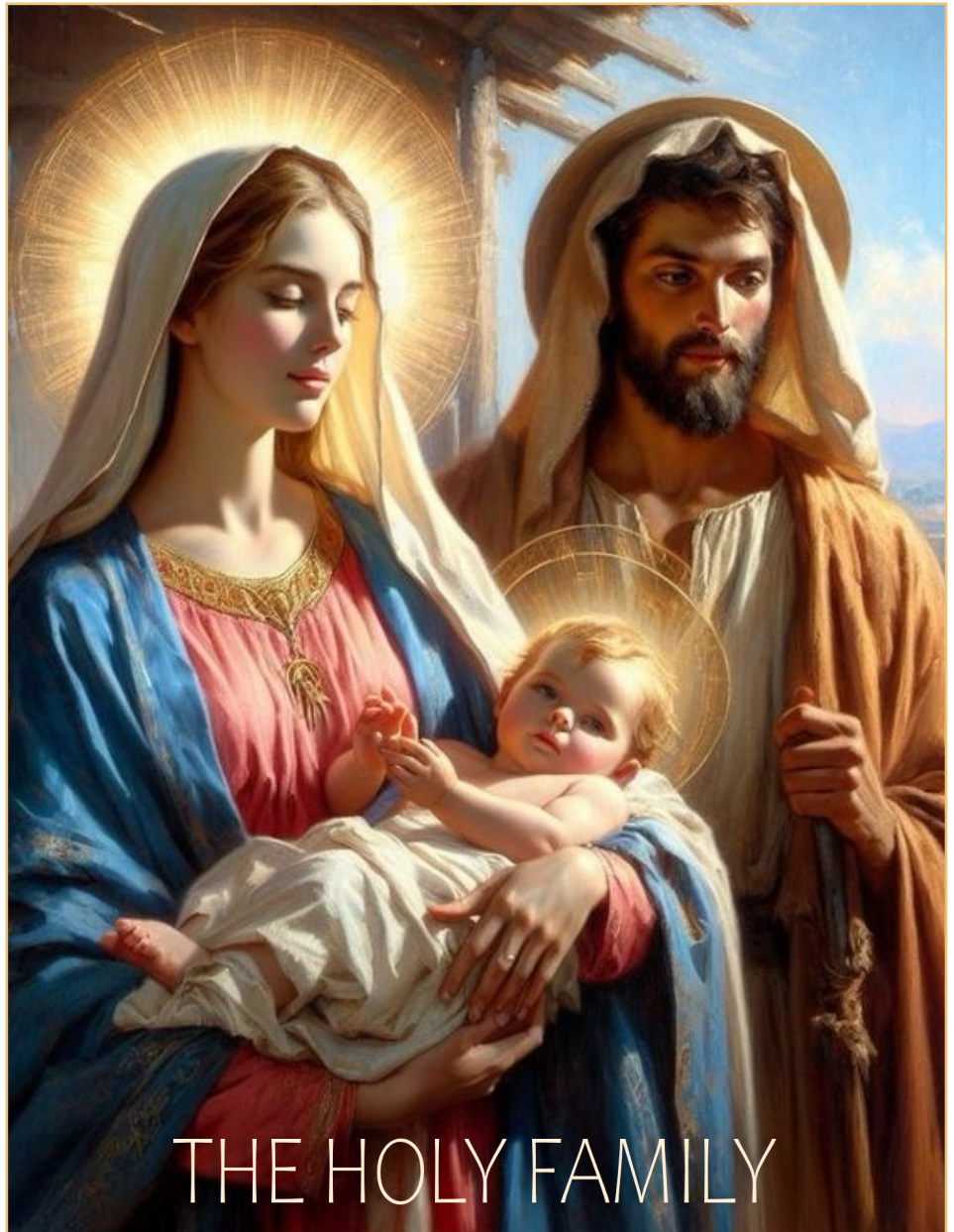
THE HOLY FAMILY

Please call the Parish Office (308) 754-4002