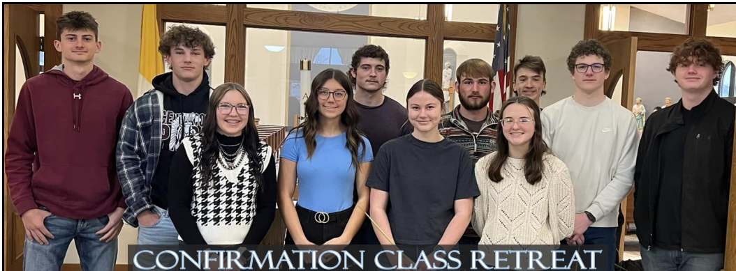
CONFIRMATION CLASS RETREAT