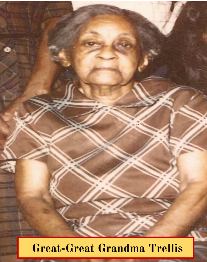
Great-Great Grandma Trellis