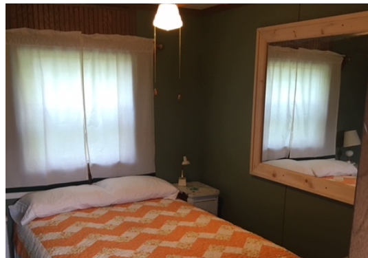
Avocado Room: (double bed)