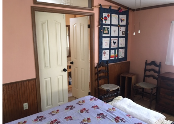
Lemon Room: (2 twin beds)