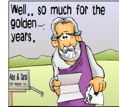
and so at age 75, Abraham receives word from the 'boss' that retirement will be delayed. Genesis 12:1-4

We live in a racist society. In the United States, a Hispanic woman is paid 67% of the salary of a white male for the exact same position. Prejudice and racism is also evident in our criminal justice system and in our education system. On Long Island, many High Schools in predominately white, affluent neighborhoods have graduation rates in the upper nineties, while some High Schools on Long Island in predominately minority neighborhoods have graduation rates below sixty percent. In one city in this country, 10% of the population is African American and over 50% of the prisoners in their jails are African American. Prejudice can be seen in the actions of our everyday life like security following black youth in stores, by people refusing to get on planes with Arab looking passengers, by asking Hispanics (Latino, Latina) if they have a green card, and by the stories and jokes that are told in all white company that degrade minorities.