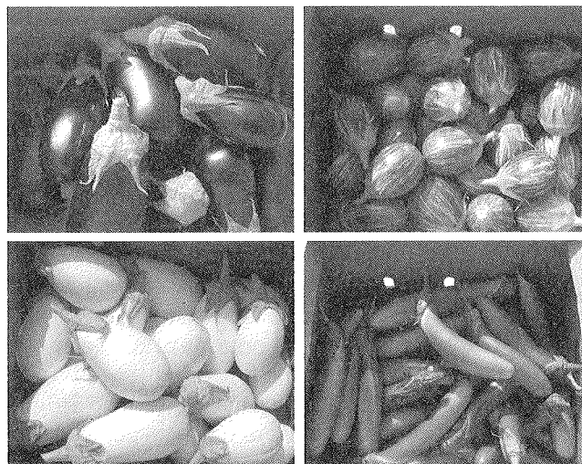
Figure 1. Eggplant fruit varies in shape, color and size.

Planting and fertilization: Choose a well-drained soil for planting eggplants. Although eggplants are deep-rooted, they do not grow well in poorly drained soil. The soil pH should be 6.0 to 7.0 for optimum