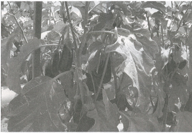
Figure 2. Staked eggplant plants with growing fruit.

growth. Plants can be spaced 18 to 36 inches apart with rows 4 to 5 feet apart. Eggplant can also be planted in twin rows with 18 to 36 inches between plants and between rows on raised beds 3 to 4 feet apart on center.