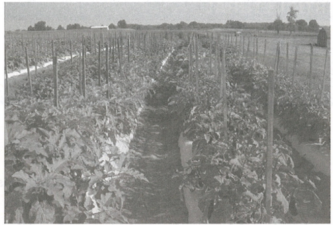
Figure 3. Staking eggplants improves marketable yield and quality.

Harvest: Generally speaking, first harvest of eggplants begins 65 to 90 days from transplanting. Eggplants should be harvested when the fruit surface is glossy and tender and before seeds within the fruit become brown. Overmature fruit have a dull, bronze appearance and the seeds become bitter. Fruit should be clipped from the plant, leaving about 1 inch of stem rather than pulling the fruit from the plant. Harvest may be done two to three times a week during peak growth, depending on the fruit size desired. Failure to