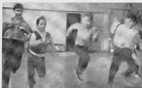
Some random shots of our lower classmen taken during a gym session at Mir H.S. Gym. Left to right: 1. The Free Shot; 2. Do it the Coach says, and 3. plain old-fashioned foot racing. (See story Page 1)