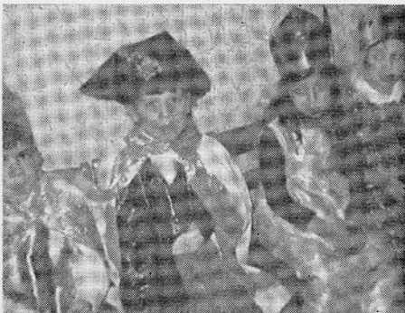
The Fathers Club of Magen David Yeshivah conducts an annual Purim Masquerade Party for all the children. Above are some of the Pirates and Princes resting up from a hard morning of Hamen-Tashen.