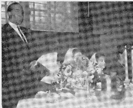
The Model Seder, which puts the children through an actual "trial run" of the Seder in every detail, is pictured above and below.