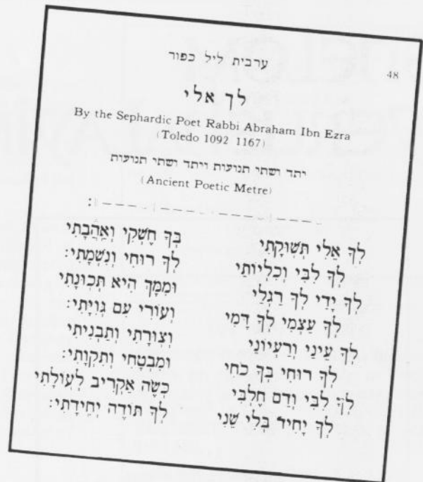
Sample Page from Kippur Book