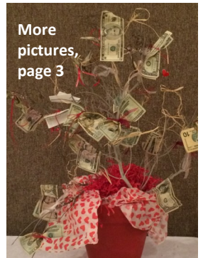
More pictures, page 3