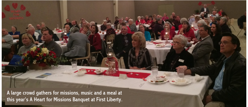
A large crowd gathers for missions, music and a meal at this year's A Heart for Missions Banquet at First Liberty.

Paid pre-registration is required through TRBA. The $10 cost covers materials and refreshments. Register by April 1 to be sure you receive a notebook.