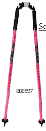
Sokkia 808897 Prism Pole