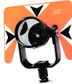
Sokkia 60857 Single Tilt Prism