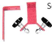
Seco 5195-01 Pole Peg