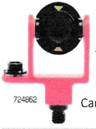
Sokkia 724862 Mini Prism