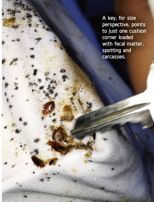
A key, for size perspective, points to just one cushion corner loaded with fecal matter, spotting and carcasses.

When I arrived and he opened the door, I looked in before entering. I could see bed bugs and bed bug