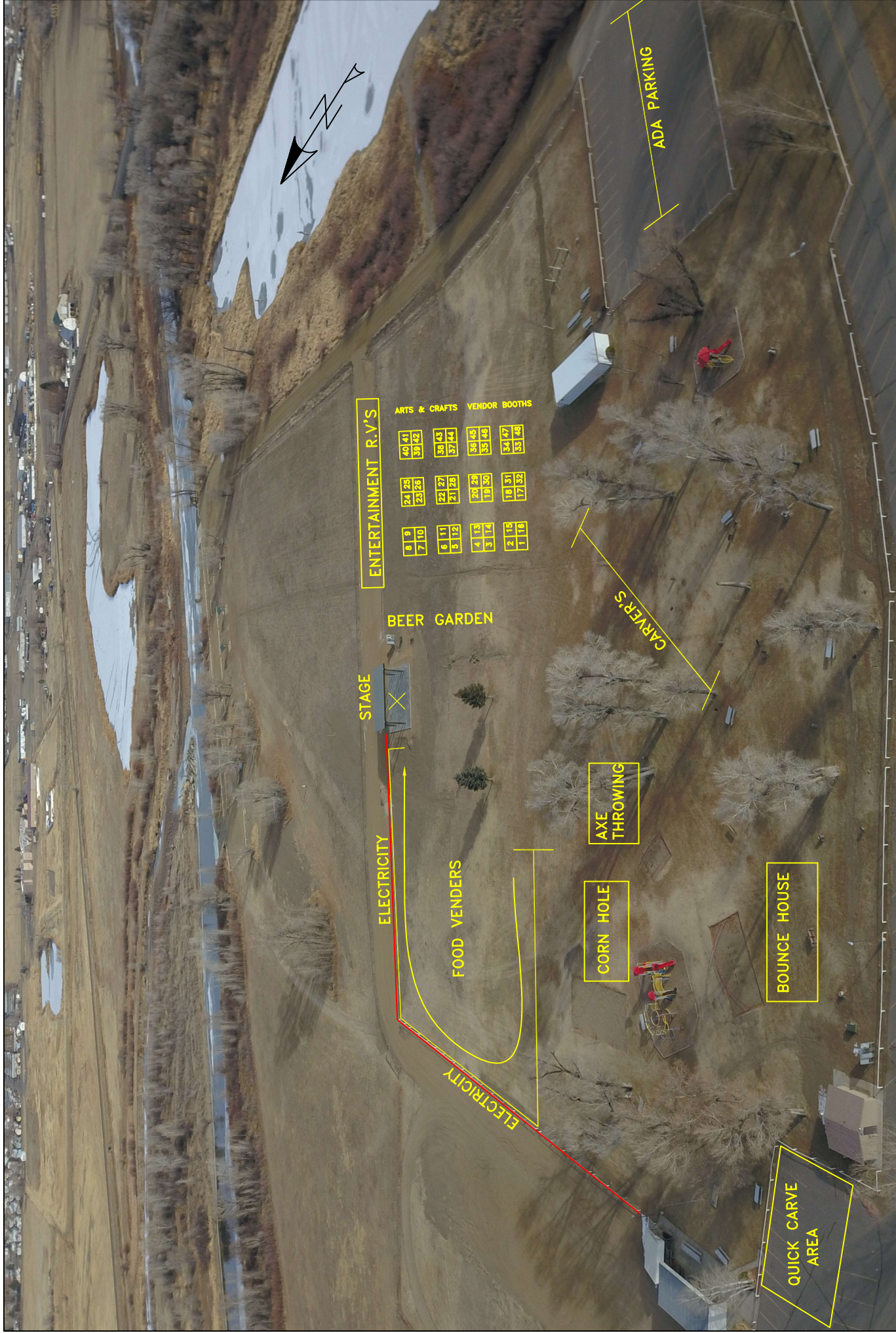
Loudy Simpson Park