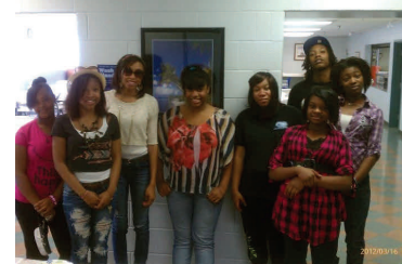
Computer Trouble-shooting and Repair class from the Salvation Army.

Trouble shooting and repair classes are not a open to the public but any organization can request one for up to ten participants.