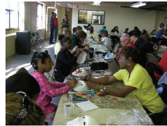
Masking Making Art Project

get to know each other. During the workshop, the mentor and mentee will work and creative together on specialized art projects such as mask-making, visual arts, interpretive reading, ceramics, drawing, canvas images and collage making in a safe and creative environment.