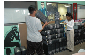
Donation from Cristo Rey High School—Kansas City

Thank you for your commitment to the environment.