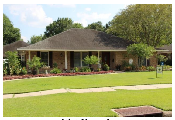
Viet Hung Le 12368 Buckingham