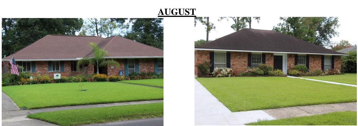
Lois Orgeron 875 Sherwood Forest Boulevard