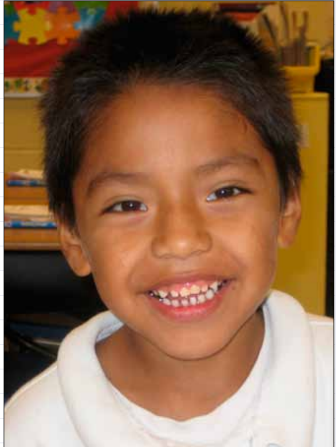
Tennessee ranks 46th in the nation in per-pupil spending for K-12 education.

However, having a positive impact on the community is only part of the reason for an