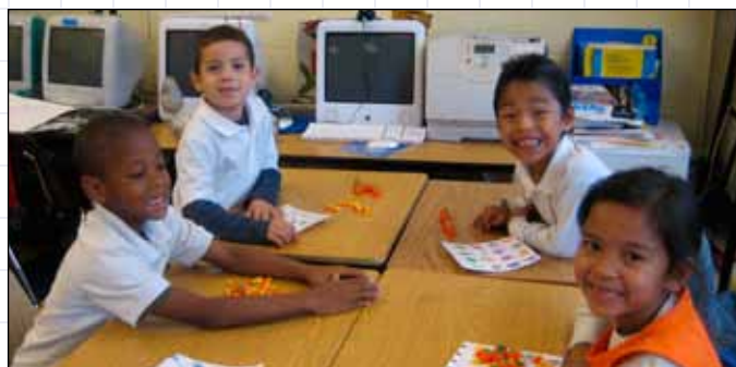
Providing honor roll or holiday parties—and craft time—is a great way to support students and teachers.

Remember that in order for your organization to truly make a difference, you must gain the trust of your school—particularly the teachers. Keep in mind that you're assisting professionals in their place of work, and honor that professionalism with respect, and by completing the tasks you set for your group.