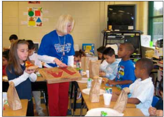
One 2PC volunteer serves pizza at a class room party.