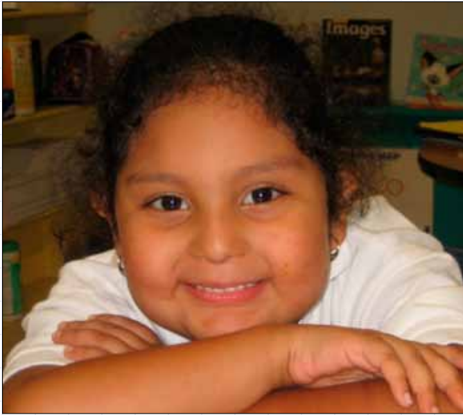
Approximately 71% of MCS students are eligible for free or reduced lunch.