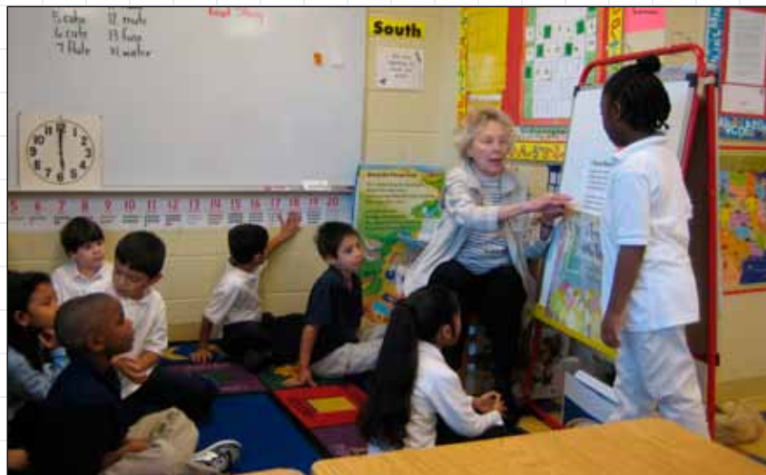
One way to serve your adopted classroom is by providing a guest reader every week.