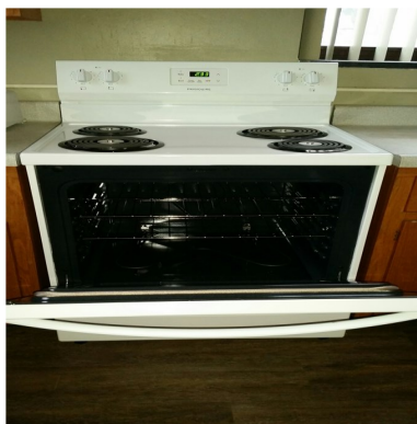
Our new kitchenette stove installed and ready for use!