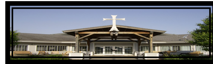
"Strengthening the Connection with the Vine"

"And my God will meet all your needs according to His glorious riches in Christ Jesus. To our God and Father be glory forever and ever. Amen Philippians 4:19-20