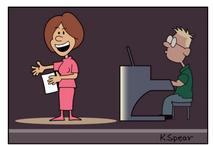
"This is Volunteer Appreciation Sunday. Find a volunteer and thank them for what you should be doing."