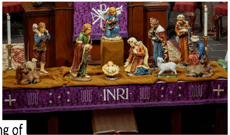
Hanging of the Green