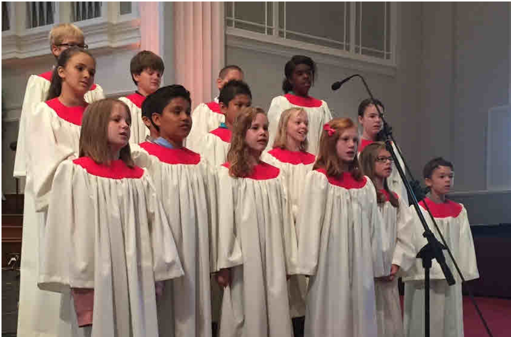
Young Musicians Choir sings during this year's Children's Sunday on May 31.