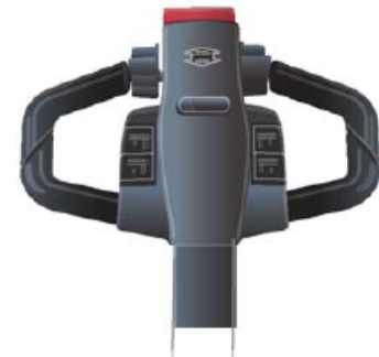
ERGONOMIC OPERATOR'S HANDLE