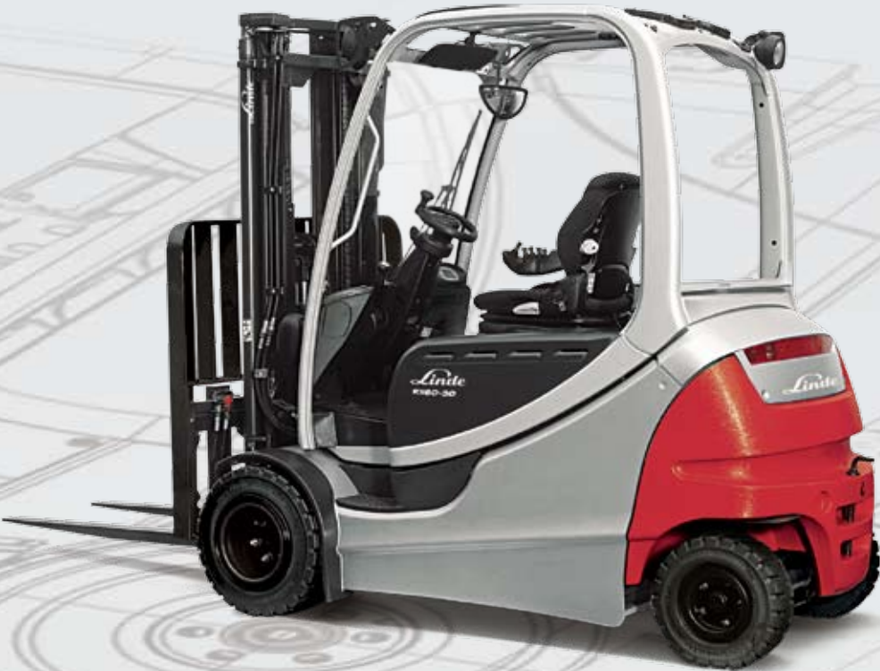
RX60-25L, RX60-30L, and RX60-35