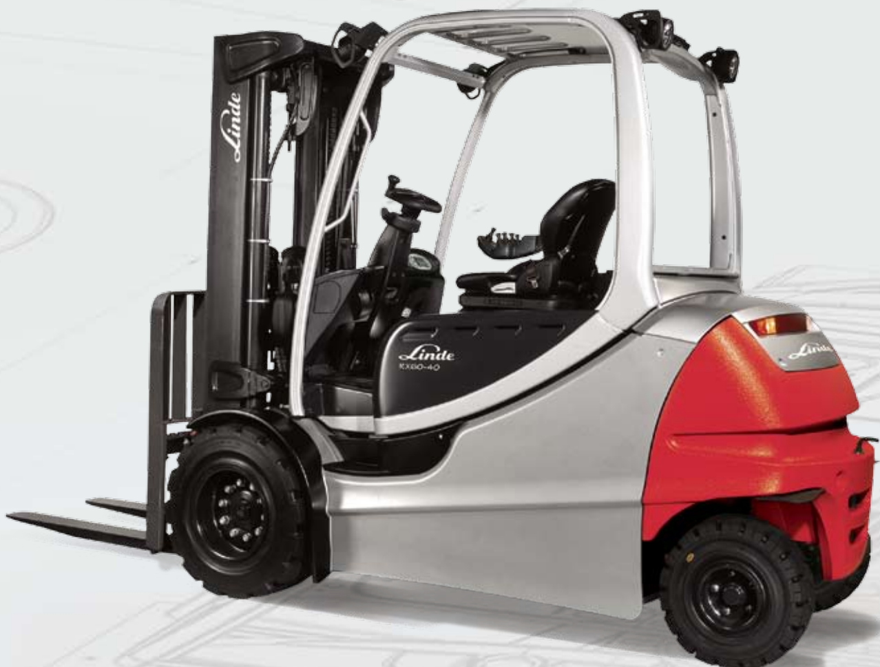
RX60-40, RX60-45, RX60-50, and RX60-50/600

Over 400 employees in our research and development group assure continuous product improvement and development of new technologies .