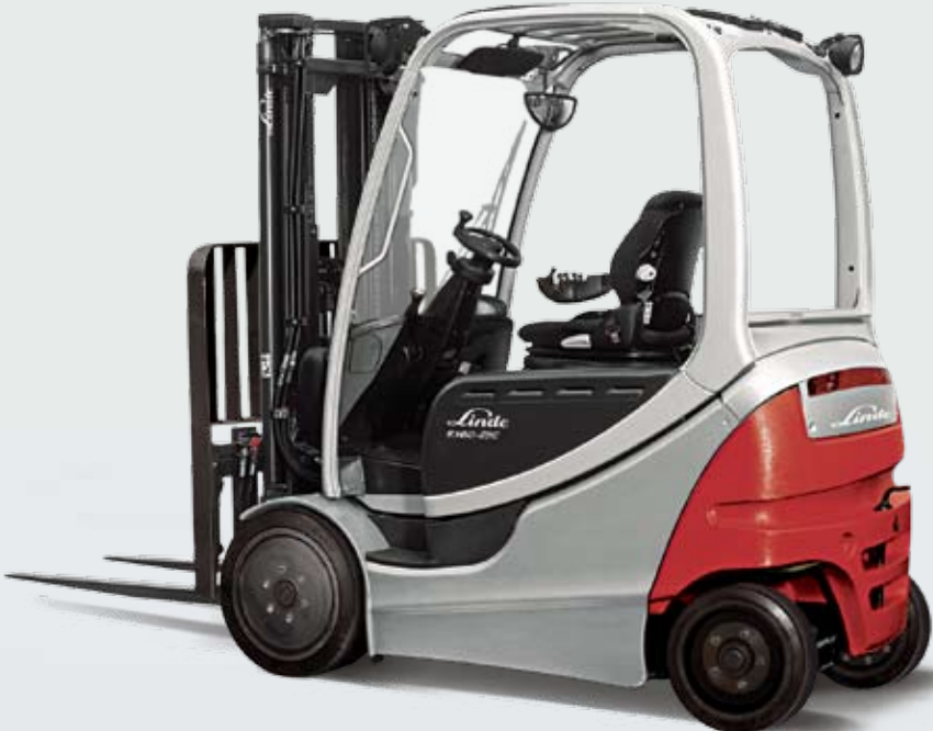
RX60-25C and RX60-30C